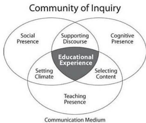
Fig. 1. Community of Inquiry Model (CoI) Framework (Garrison, 1999).

The research study spanned three terms in which different modes of feedback were given the same assignment. During the Summer 2020 term, students received written only feedback which would be the control or standard intervention. During the Fall 2020 term students received written and audio feedback. Finally, during the Summer 2021 term students a combination of written, audio and video feedback. Feedback, epistemic and suggestive in nature, was given for five consistent discussion posts within the class and completed within a week of completion through technology resources within the Learning Management System (LMS). All feedback was text-based to ensure differences in the dependent variable were due to mode of feedback and consistent. For example, for audio and video feedback, the instructor typed the feedback and read the feedback via the designated mode of delivery. The outcome measure was placed within the LMS two weeks prior to finals.